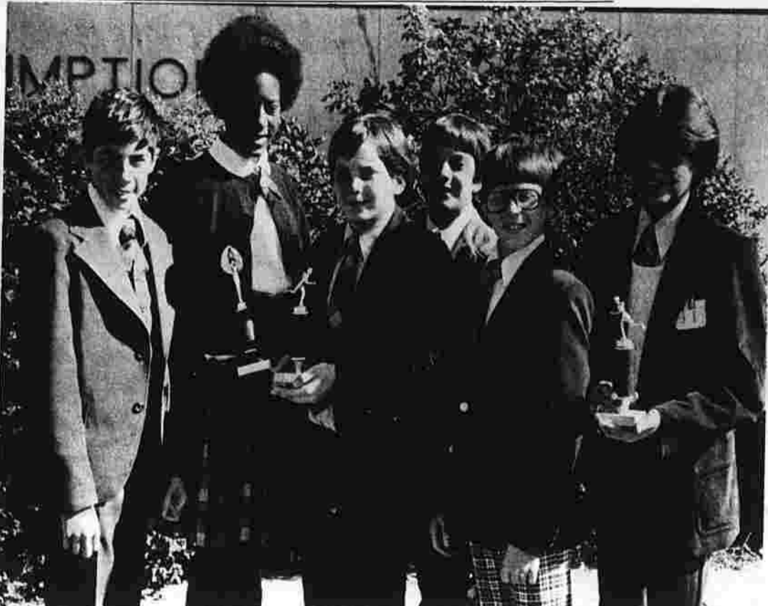
Assumption Athletes Gain Fourth Place