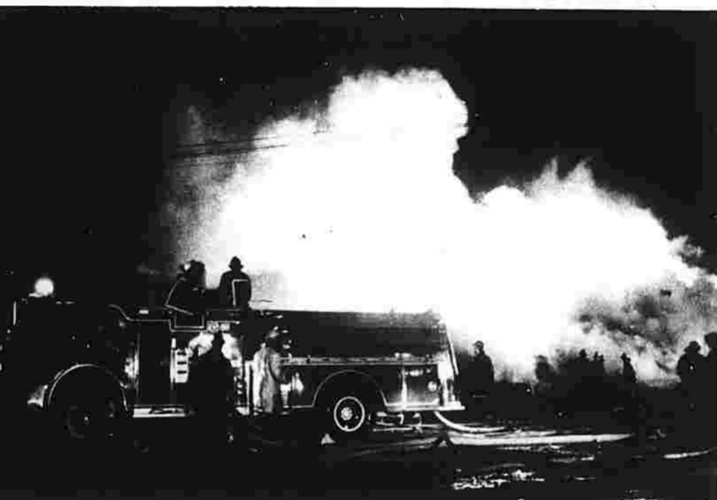
Flames and smoke fill the sky in Bolton as firemen fight against strong winds that fanned a barn fire on Route 44A Monday night. The barn was owned by Albert Giglio.

LOS ANGELES (UPI) - Four major brush fires burned out of control through Los Angeles suburbs today, sending hundreds of residents fleeing down smoke-choked roads. A car and a pickup truck, loaded with persons and belongings fleeing from Malibu, collided head-on in the smoke, killing two.